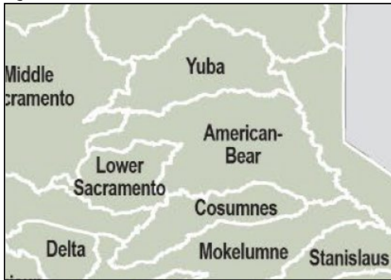
Figure 2. American-Bear Watershed